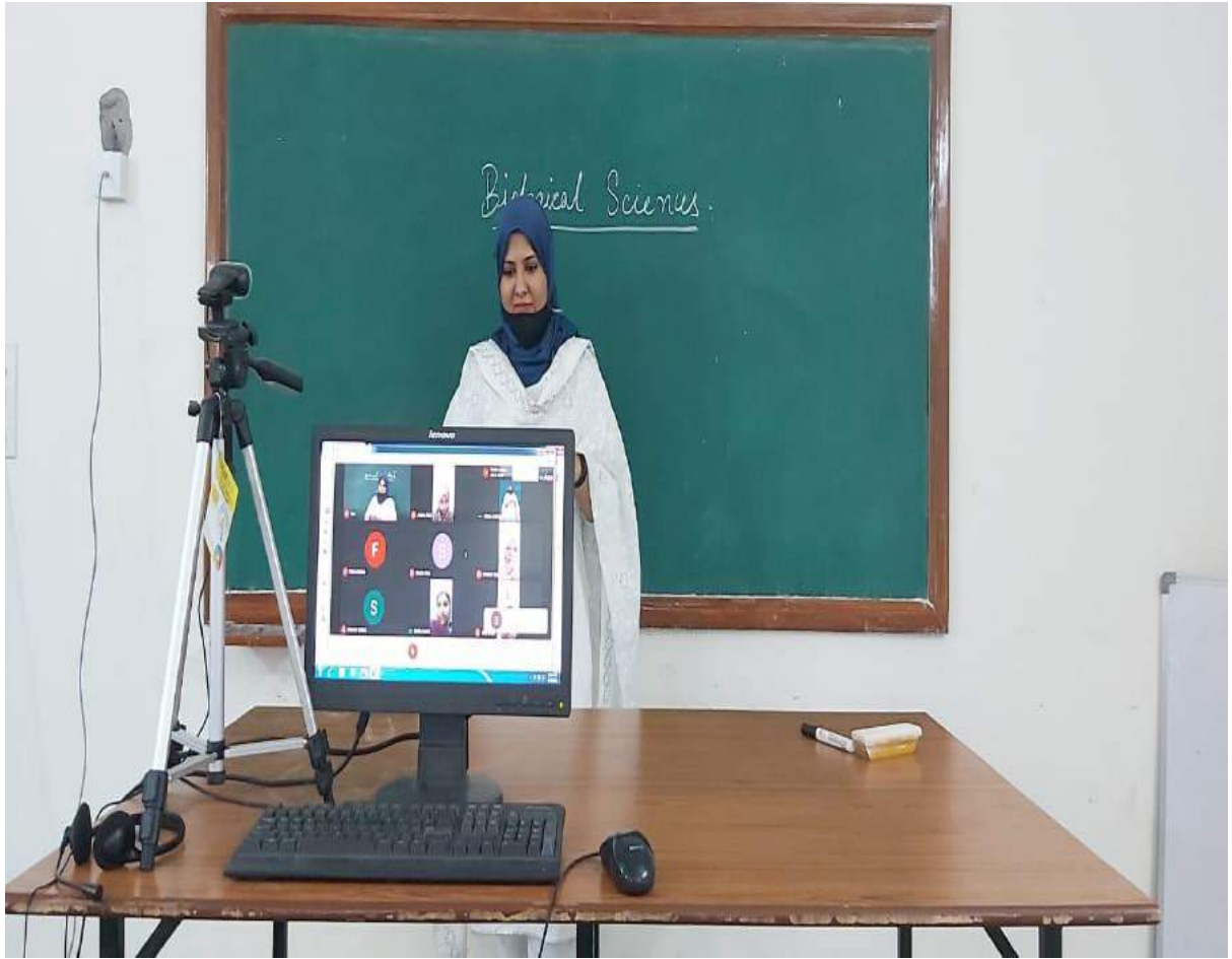
FACULTY USING ICT WHILE TEACHING