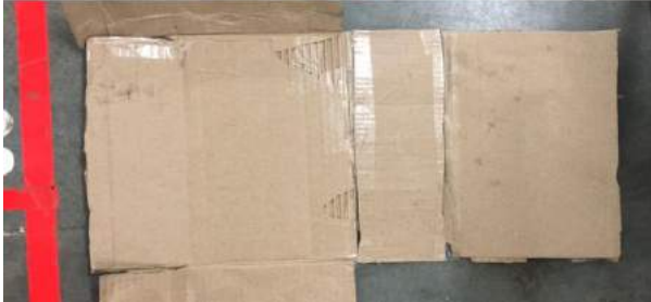
CONSTRUCTIVE USE OF WASTE MATERIAL