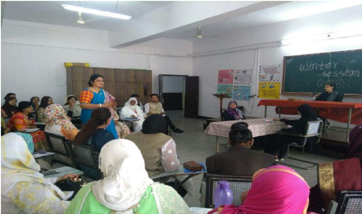
MOCK PARLIAMENT IN COLLEGE