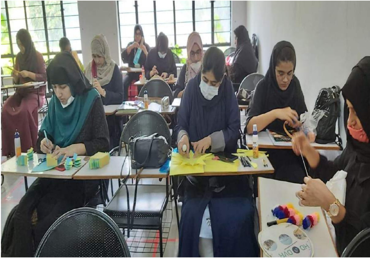
ART AND CRAFT ITEMS