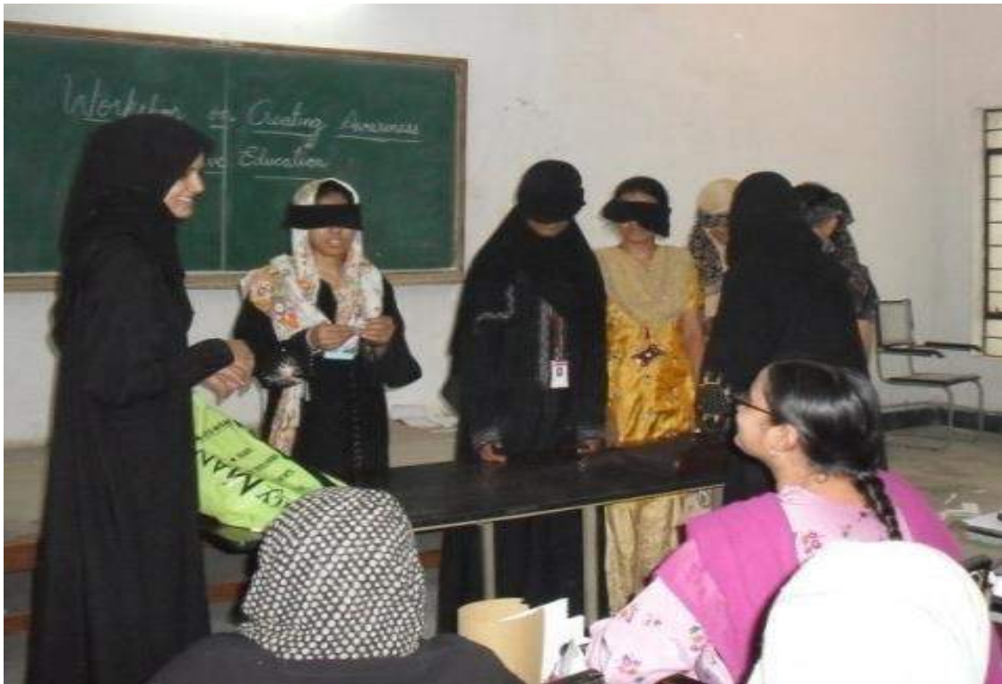
EPC PROJECT ACTIVITIES