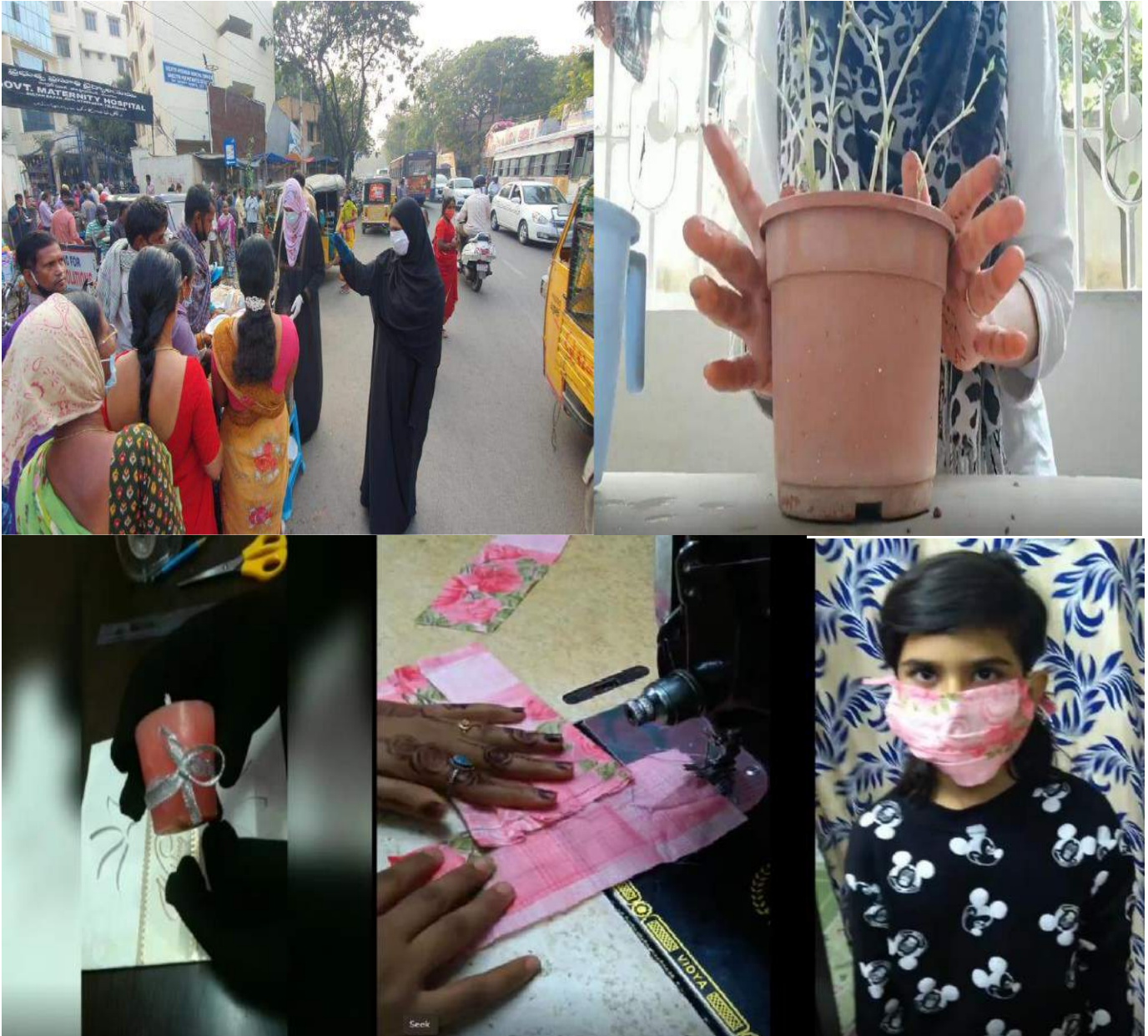
Reuse Of Material For Self Help And For Others